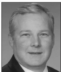
Lieut. Governor Tim Griffin

ACAAA's Annual Awards Luncheon—being held that same Wednesday to recognize the year's finest volunteer efforts as well as its happiest client success stories (see list of nominees, page 6)—will boast the distinction of being introduced by special guest speaker Arkansas Lieutenant